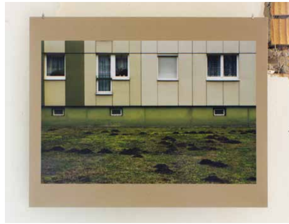
Garden 2017, C-Print, 90 cm x 60 cm

The experience of this architecture through a sense of space is taking center stage in the photographs, an approach to the emotionally perceptible level of those spaces.