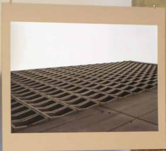
Ornamentation 2017, C-Print, 90 cm x 60 cm