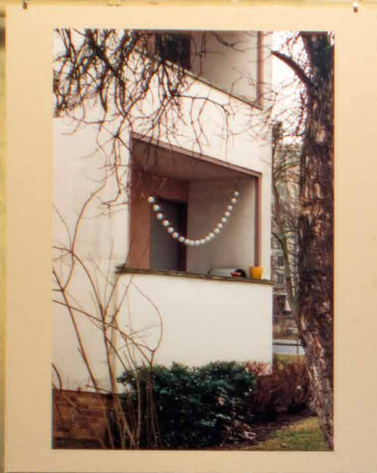
Diva 2017, C-Print 2017, 60 cm x 90 cm